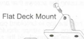
Flat Deck Mount